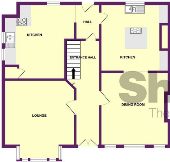
GROUND FLOOR 717 sq.ft. (66.6 sq.m.) approx.